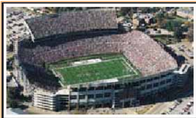
Jordan Hare Stadium